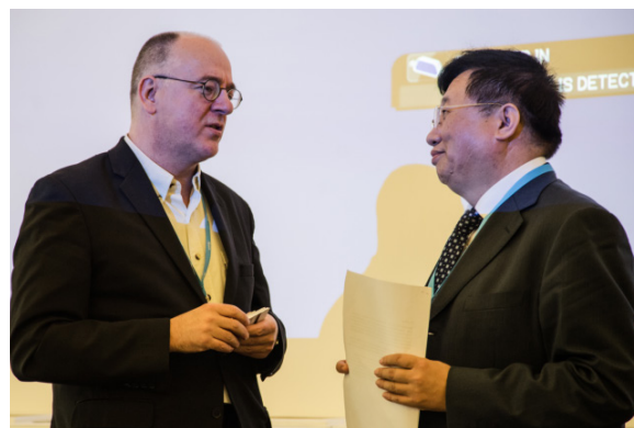
Two keynote speakers talked with each other.