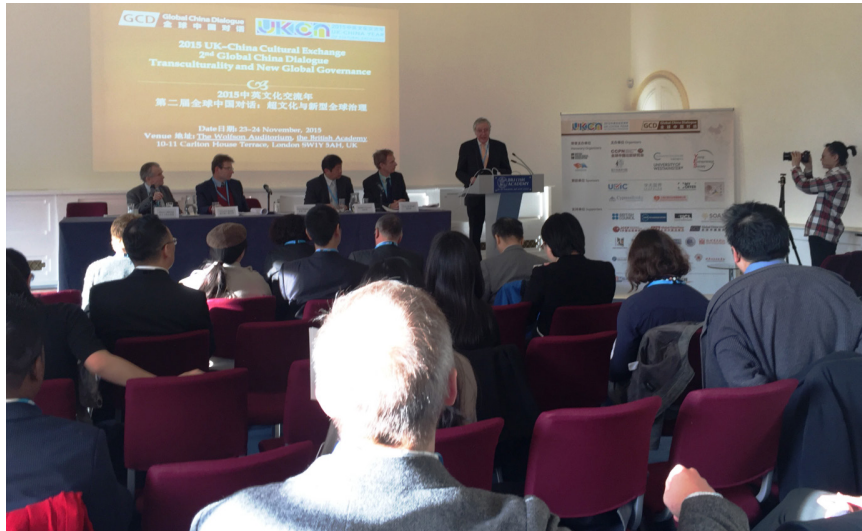
The opening session.