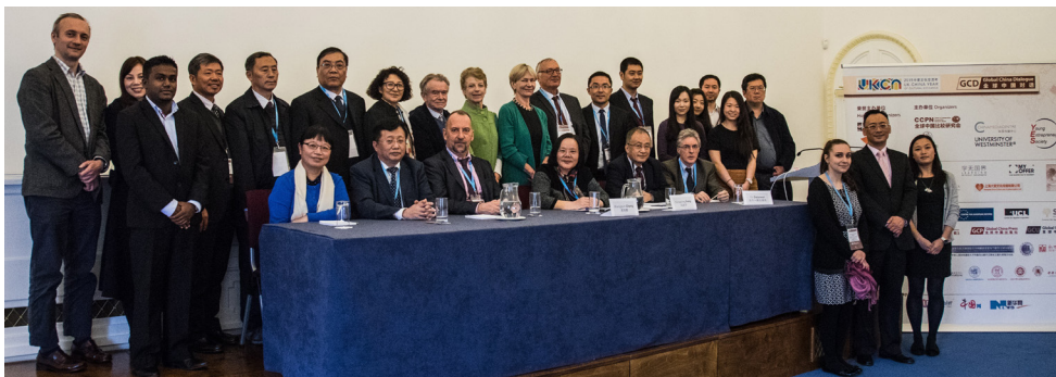
Top group photo shows participants in the dialogue on the 23 November, bottom group photo shows those who participated on 24 November.