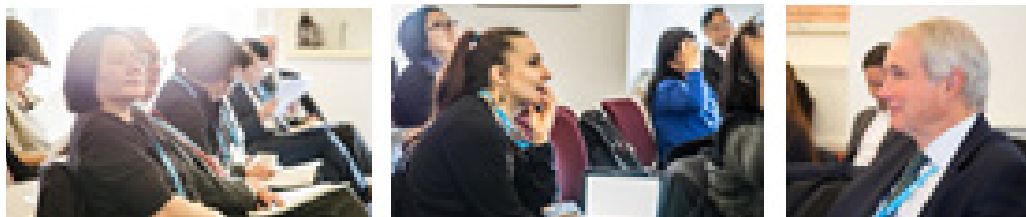
Audience during the event.