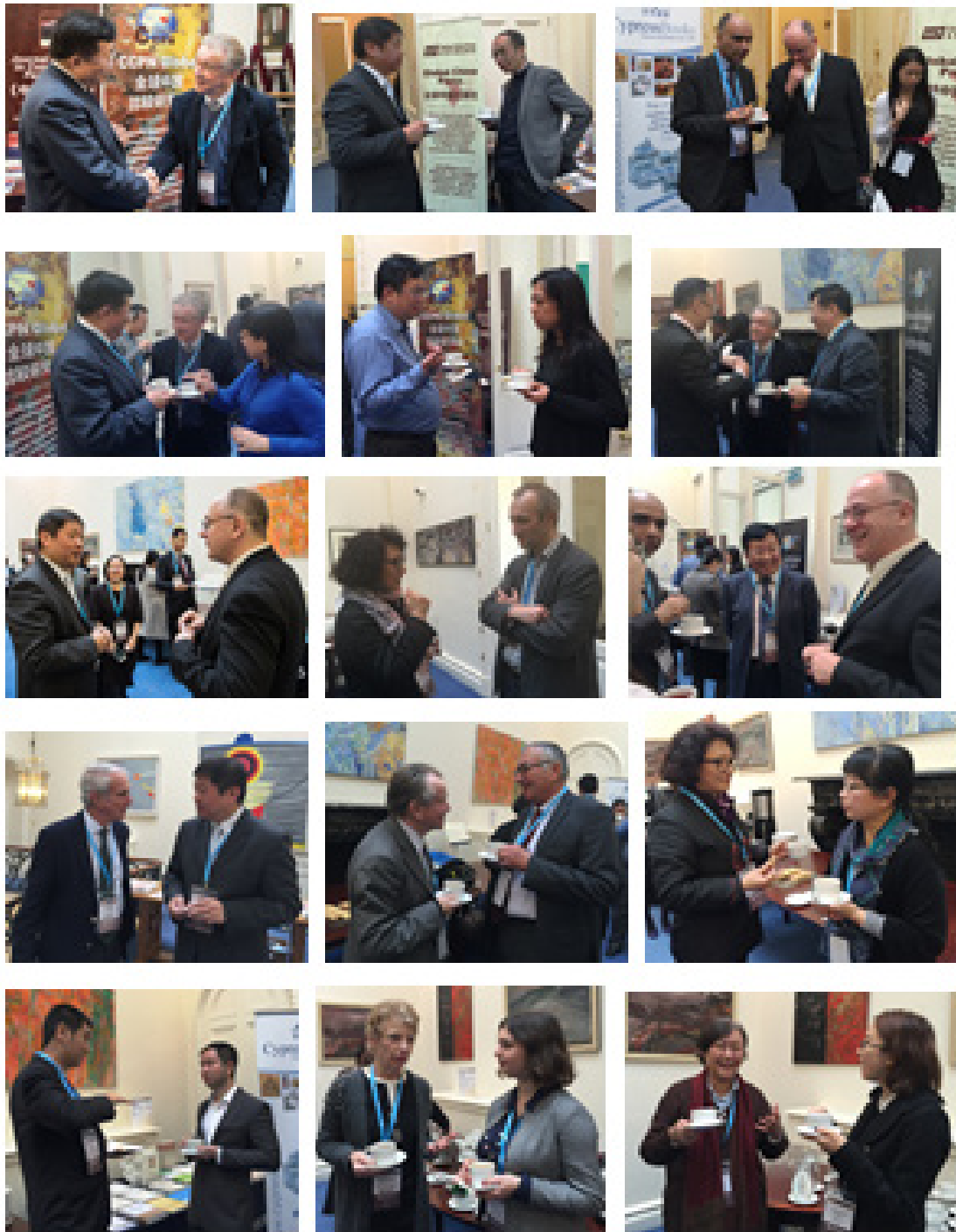
Participants were networking during the breaks.